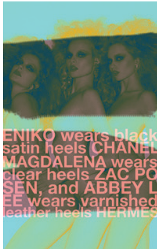
Purple Magazin Fall Winter 2009

Naslov njezinog rada FW/SS (2014) skraćena je imena godišnjih doba korištenih u sklopu modnih kampanja: fall, winter, spring, summer. Prvi element rada je kolekcija modnih fotografija preuzeta iz različitih internetskih modnih časopisa. Posredstvom digitalne manipulacije fotografije su napravljene tako da se sakrije ili naglasi sveprisutan ženski seksipil u suvremenoj modi.