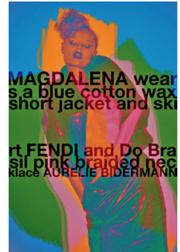
Purple Magazin Spring/Summer 2011 #2

Foster's FW/SS (2014) is a body of work, whose title is taken from fashion campaigns' designation of the seasons: fall, winter, spring, summer. The first element of the work is a collection of fashion photographs taken from different fashion magazines posted online. Through digital manipulation, the photographs are recreated to censor and highlight the omnipresent sex appeal typically portrayed by women in contemporary fashion.