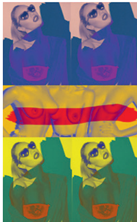
Purple Magazin Spring/Summer 2011

Izložba ostaje otvorena do 26. veljače 2015.