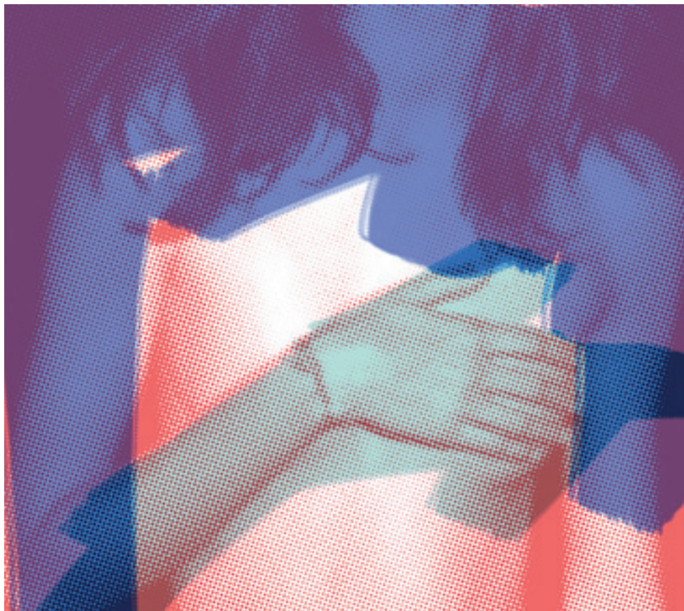
Azul Jeans 2011